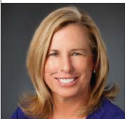
PATTY GASSO Head Coach